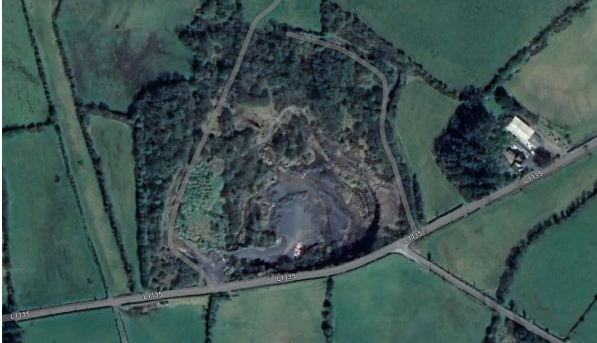
Figure 2: Aerial photo of the site

Monaghan County Council's Environment Section has also been consulted regarding this application and has had several comments. The following conditions will be in place on the site during construction and operation: